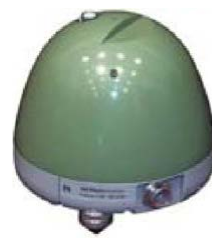
Figure: Sketch of GPS, laser interferometer and seismic instrumentation that will be deployed in Geodyn